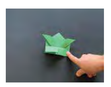
Step 11: Fold the paper down to the bottom edge.