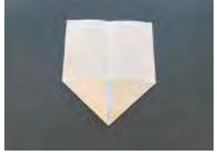
Step 3: Fold the entire top down so that it resembles an envelope. Make sure you leave a half inch or so at the bottom — you don't want the top point to evenly meet the bottom edge.