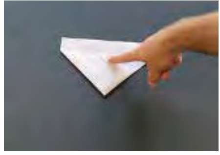
Step 6: Fold in half, but make you sure you fold it outwards on itself, not inwards. You want the previous triangular fold to be visible on the bottom edge.