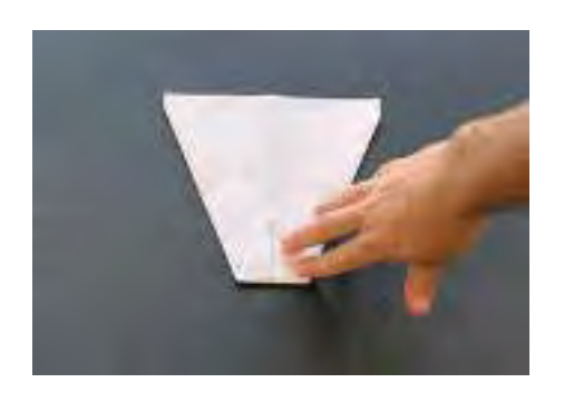
Step 4: Fold the wings down so that you're making a straight line across from the top of the snub nose. Repeat on the other side.