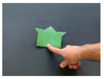
Step 10: Fold the bottom of the paper up to the top corner of the triangle.