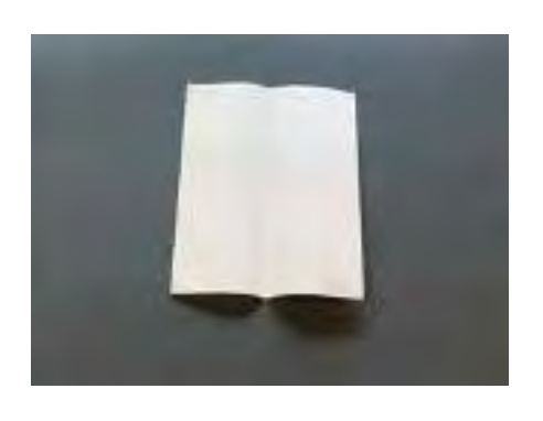
Step 1: First you fold the paper in half lengthwise, and then unfold. This initial crease is simply a guideline for the next folds.