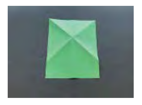
Step 6: Make a squash fold, as shown below. Bring the sides to the middle, so they meet each other. Flatten the top of your rectangle to make a triangle.