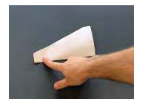
Step 5 : Step 5: Fold the entire plane in half, in on itself. This creates the snub nose, which gives the Bulldog Dart its name.