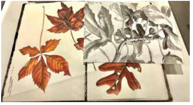
Diane Kent, "Leaf II" 2019 Watercolor on Paper 20"x22"

"Field Journal" 2020, Watercolor and ink