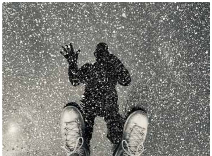
Aerial with black and white filter