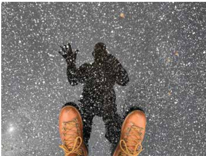
Aerial in color

Step 3: Write a paragraph that tells your story.