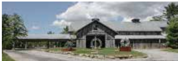
The Bascom front view

Step 3: Now think about the other objects and structures in your yard like trees and small buildings. What do they look like from above? Where are they located in the yard? Add these objects to your drawing.