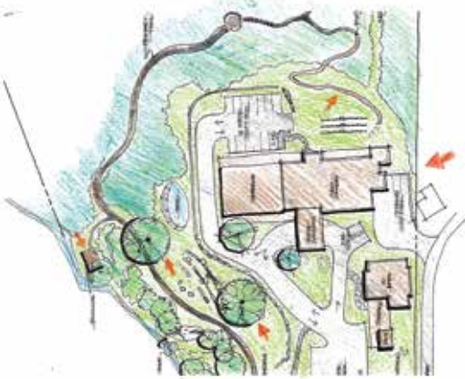
The Bascom site plan in color

Step 5: Explore your yard for signs of human activity. Look for places where trees were cut, or dirt was moved. What has been added, and what has been removed? Find places where wildlife are living close to your house, and mark them on your drawing.