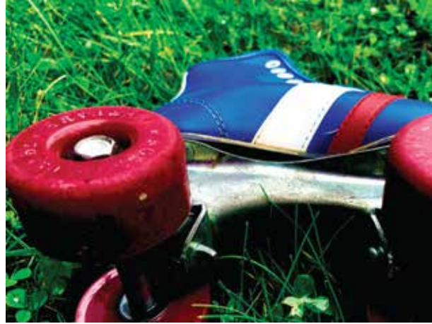
Macro with more saturation