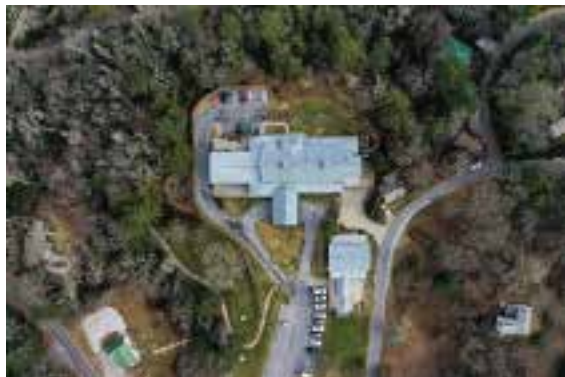
The Bascom aerial view