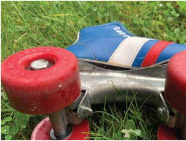
Macro in original color