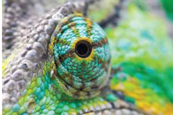
MACRO Chameleon's Eye

Step 1: Using the camera app on a mobile device, take at least two photographs that tell a story. One should be taken from above (like an aerial photo), and the other should be taken really up close (macro).