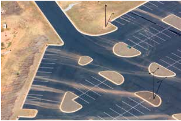
AERIAL Alex MacLean, Parking Lot Drift

We want to take pictures that tell a story, but we want the picture to be “abstract”. When something is abstract, we can recognize some things in the image, and some things become a little more mysterious. One way to abstract an image is to photograph your subject from above, like Alex MacLean. Another way is to photograph something up close. This is called macro photography. See the examples below.